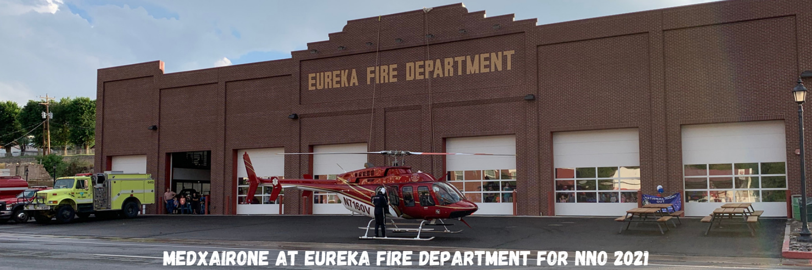
MEDXAIRONE AT EUREKA FIRE DEPARTMENT FOR NNO 2021