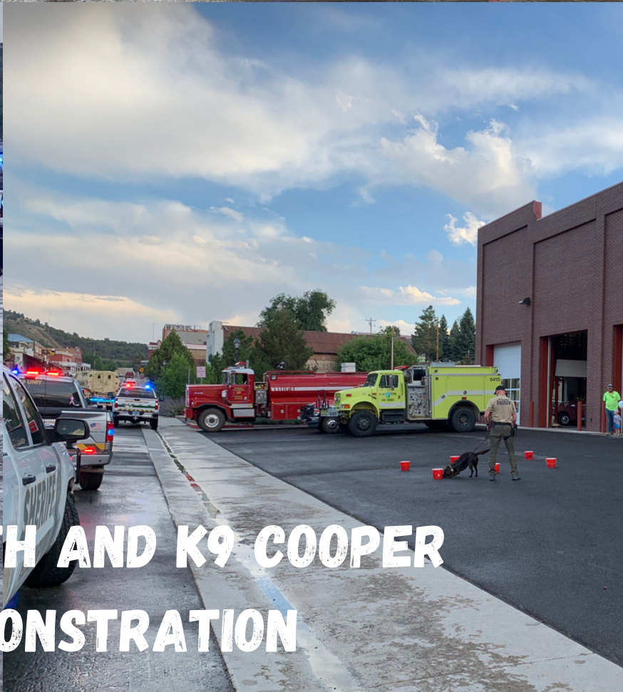
DEPUTY KORTH AND K9 COOPER K9 DEMONSTRATION